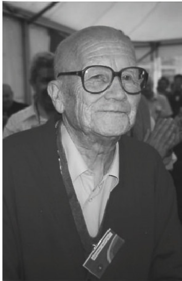
E d u a r d o B o n n i n Founder of the Cursillo Movement

THE NATIONAL BULLETIN OF THE CANADIAN CONFERENCE OF CATHOLIC CURSILLOS